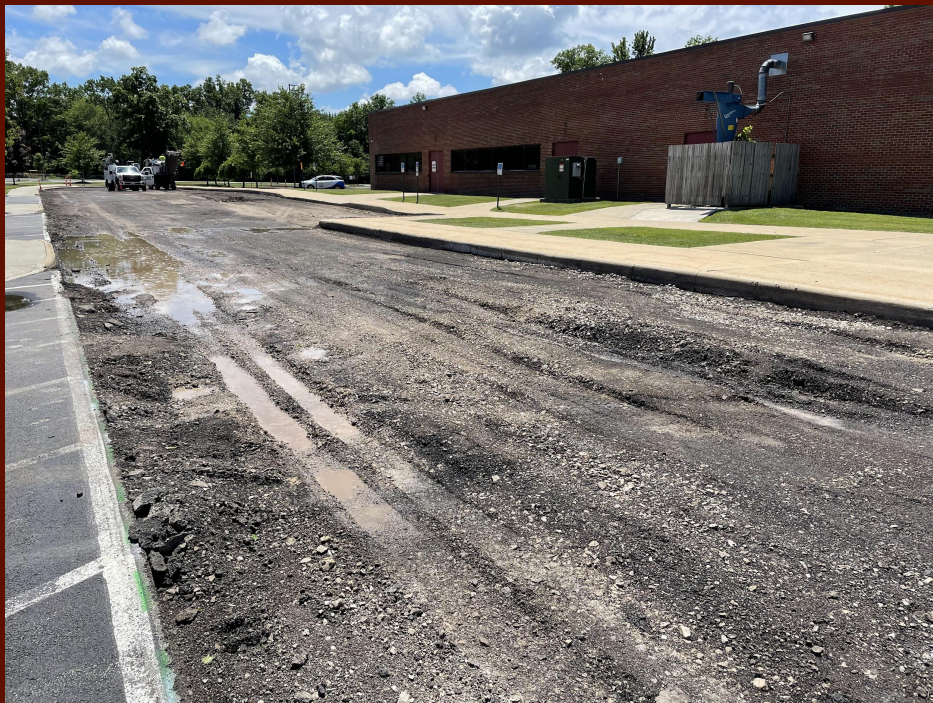
South Drives: Before/During