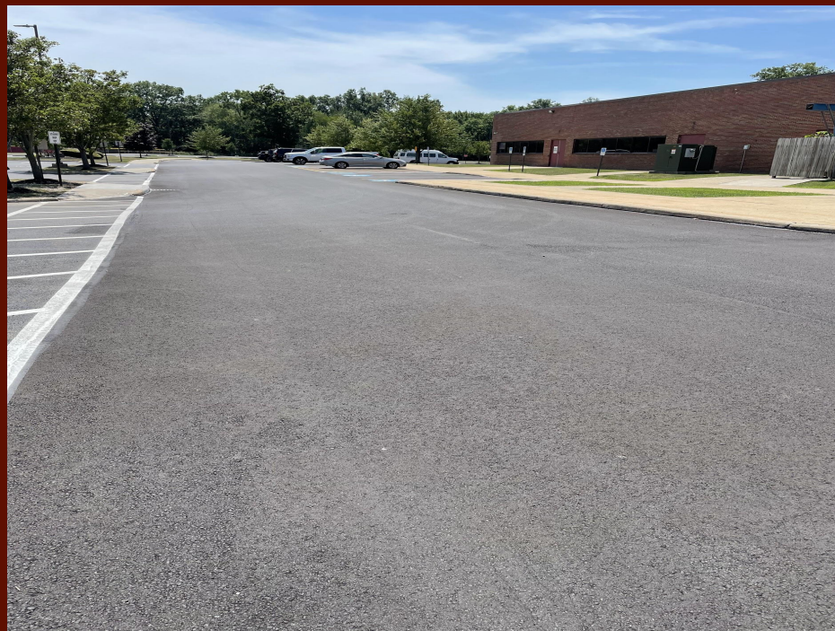
South Drives: After