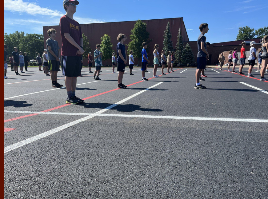
North Lot: After