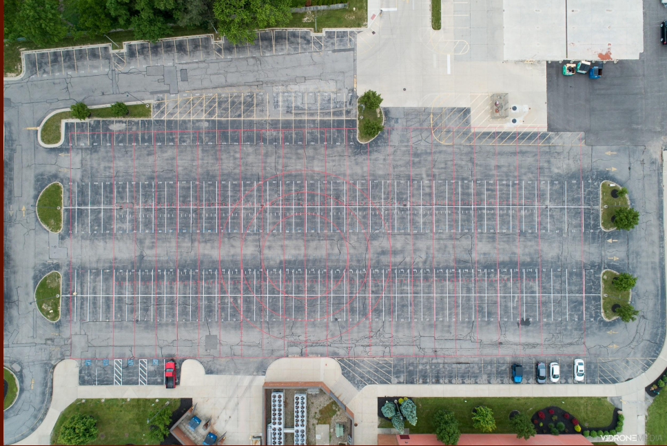
North Lot: Before