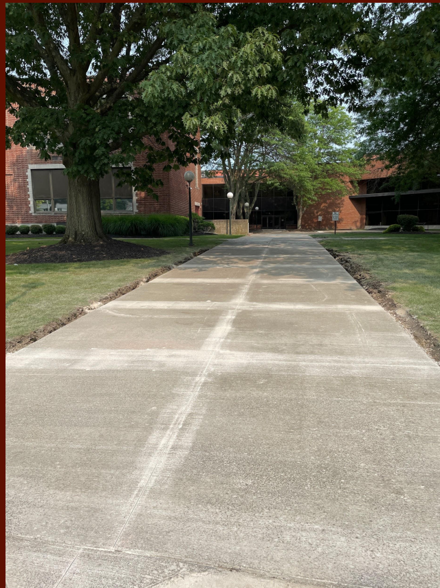
Board meeting entrance: After