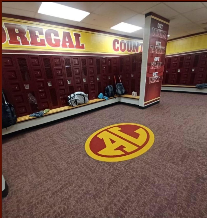
Girls Locker Room: After