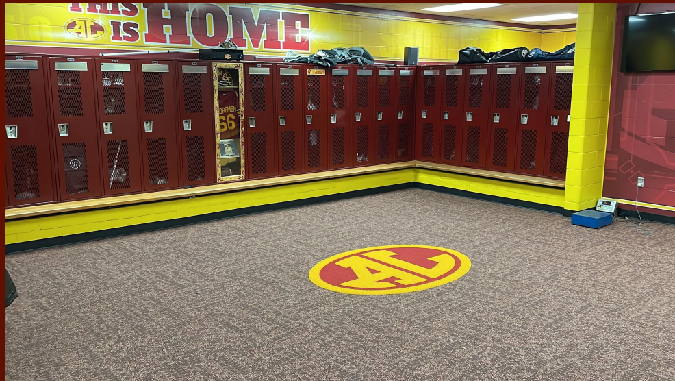
Boys Locker Room: After