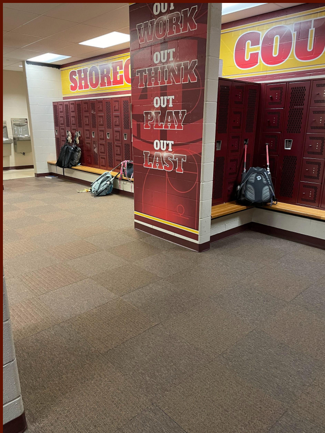
Girls Locker Room: Before