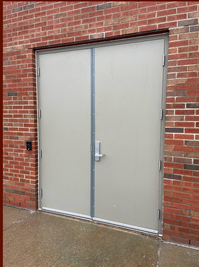
Technology Dept. Doors: After