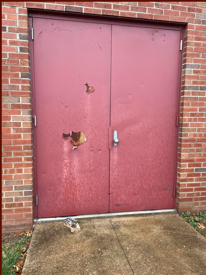
Technology Dept. Doors: Before