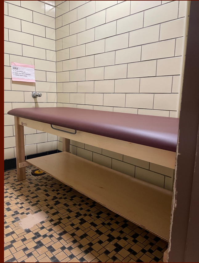
Westview: A classic example of how we try to meet modern-day needs in a 1956 facility.