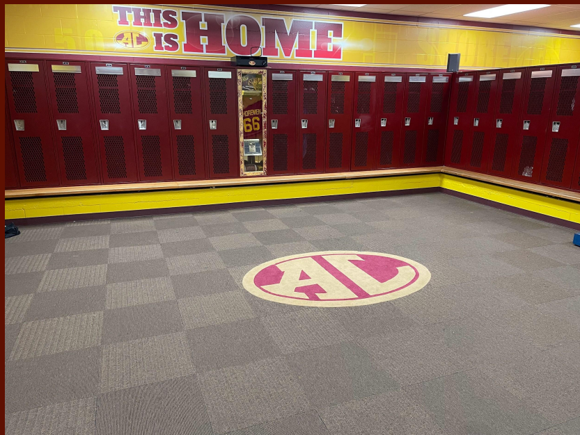
Boys Locker Room: Before