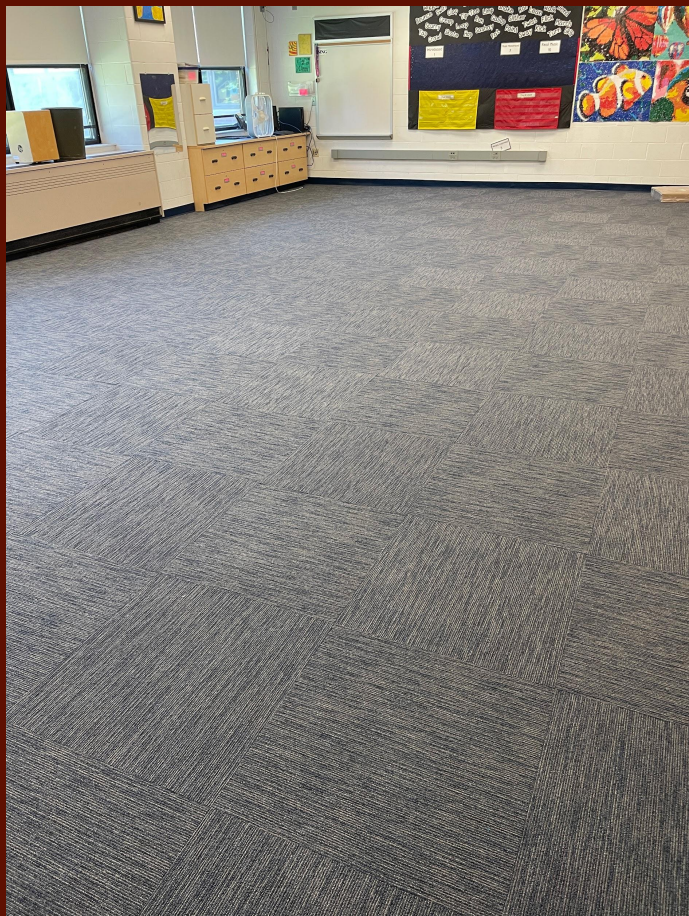
Music room carpet (old carpet was torn)