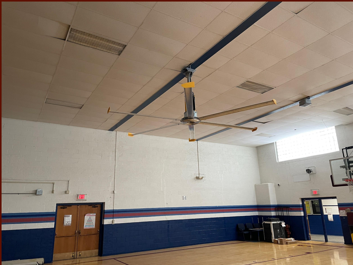
Gym fan (Eastview PTA contributed to this project)