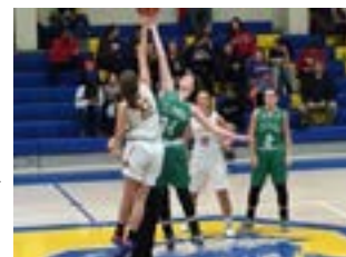
Shoregals fight for possession

Girl basketball is just as intense when it comes to high pace and fascinating minutes of gripping the edge in of your seat the middle gym. This they have a team of se- and juniors well as some coming from sophomores. Head varsity Coach Zvara comments on looking towards a competitive season as there is a lot of talent in the conference.