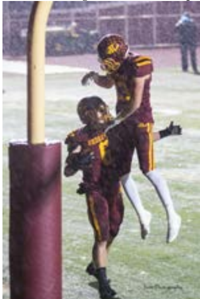
Players in celebration after touchdown

the offseason and bonded together in the weight room. We knew we had a talented team going into the season, but if we didn't put the work in nothing would come