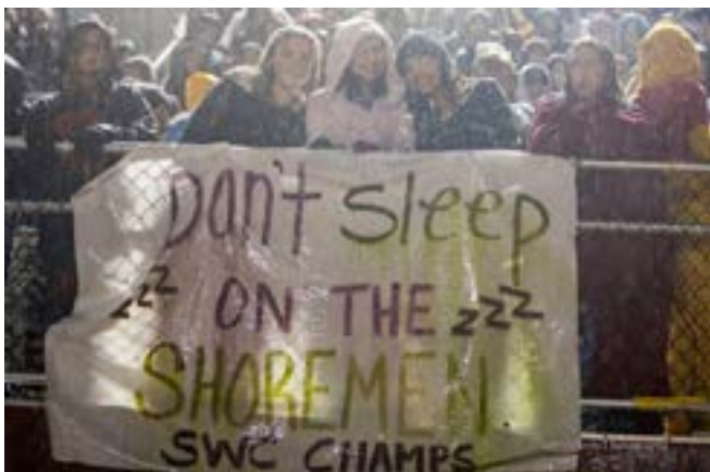
Shoremen student section

Thanks to hard work and dedication the varsity football squad was able to have lots of success this year, including six blowout wins against Elyria (42-15),