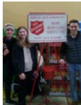
Key club bell ringing at Giant Eagle

The work that key club devotes to our community really makes Avon Lake a better place, and we're all grateful for what they do. For anyone interested in joining Key Club, meetings are in room 114 every Tuesday morning at 7:15.