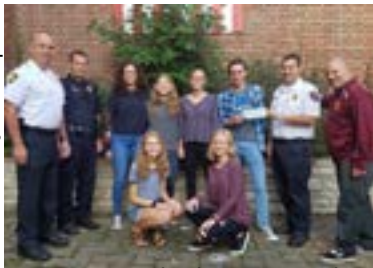
Key club receiving a donation from the ALPD