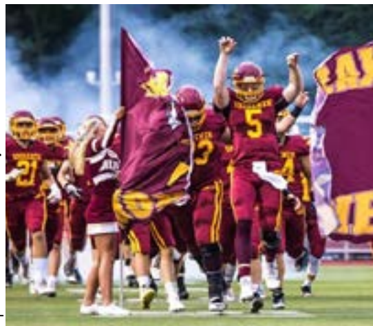
Shoremans get pumped up before a game earlier this season

celebration of Avon Lake history, your very own Avon Lake High School is doing its part to research and inform the communi-