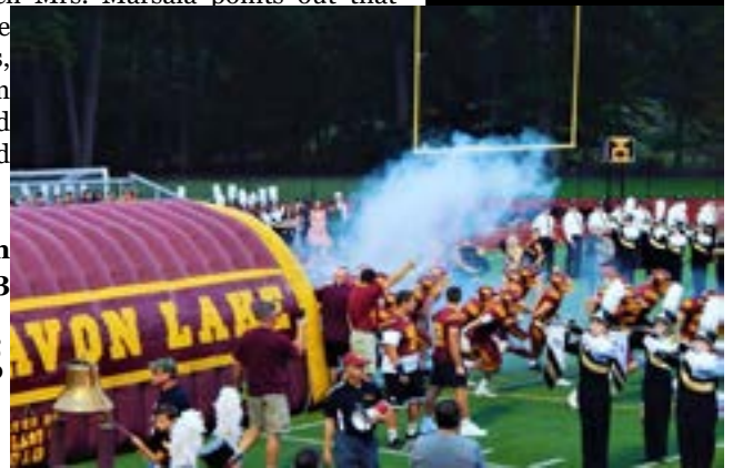
The Shoremen football team and fans getting riled up before a game.